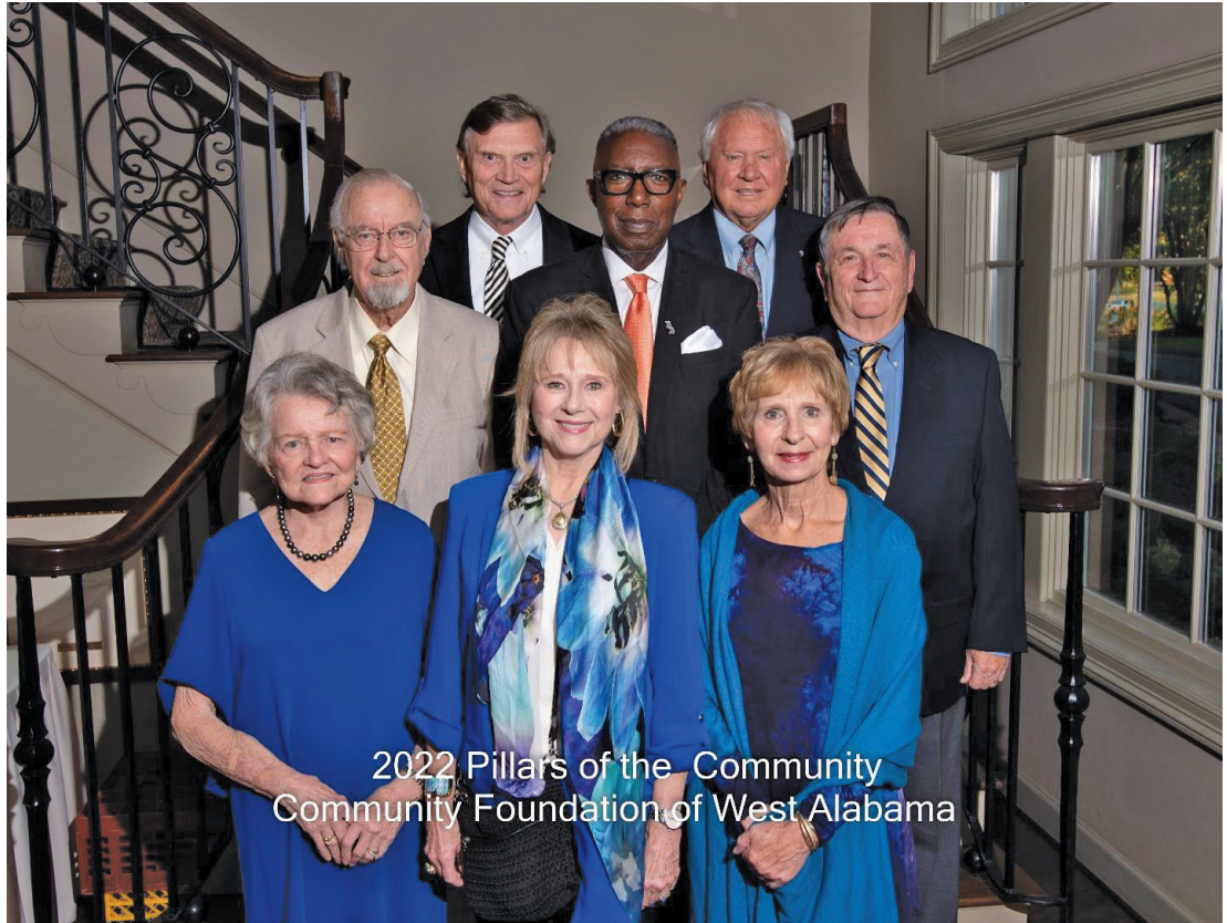
2022 Pillars of the Community Community Foundation of West Alabama

The 2022 class of the Pillars of West Alabama was recognized Thursday, October 13 in front of a capacity crowd at Indian Hills Country Club. This was the 18th year of the program that recognizes citizens who have contributed much to our community.