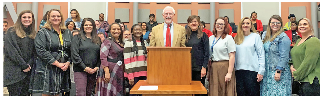
Grants given to 10 Tuscaloosa City Schools teachers